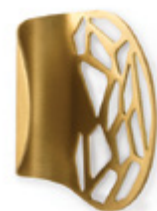
ATLAS CM3008 Cabinet Handle