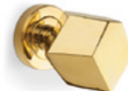
KARAT CM3022 Door Knob