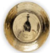
POKÉ CM3040 Cabinet Handle