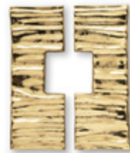
BARUKA CM3037 Door Pull